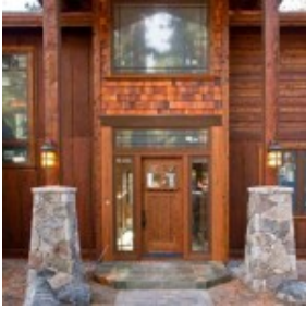
The exterior.