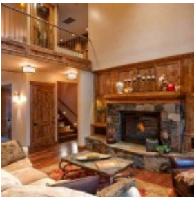
Living area of Incline Village house.