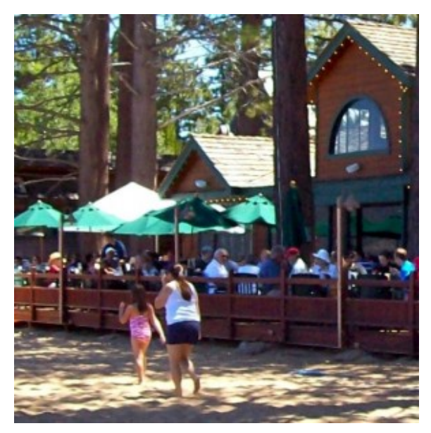
The Camp Rich area by the Beacon has long been a favorite of locals and