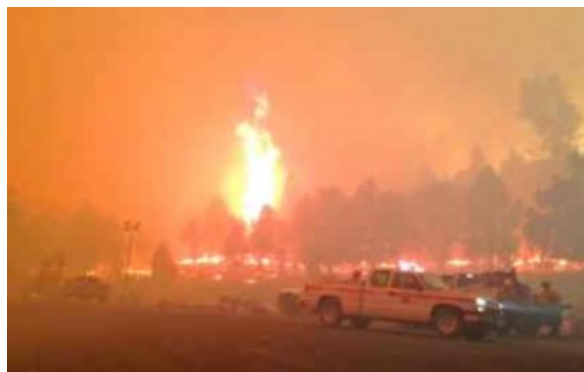
The Rim Fire on Aug. 21.

The five North Tahoe Fire Department firefighters who were sent to the Rim Fire are expected back in Tahoe Tuesday tonight.