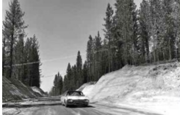
Pioneer Trail wasn't always paved.

In 1963, Pioneer Trail was paved only from Highway 50 near Stateline to just south of the Glenwood Way junction.