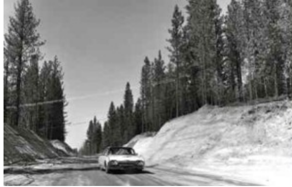
Pioneer Trail wasn't always paved.

In 1963, Pioneer Trail was paved only from Highway 50 near Stateline to just south of the Glenwood Way junction.