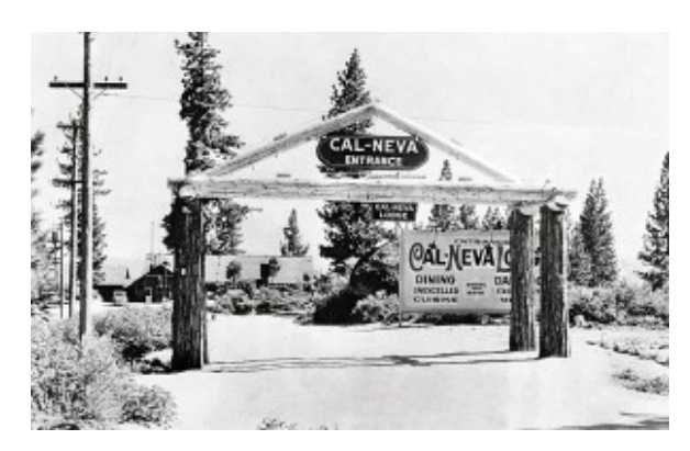
Cal-Neva int the late 1930s.

The historic Cal-Neva Lodge straddles the North Shore state line on the promontory between Brockway, Calif., and Crystal Bay, Nev.