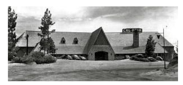
Cal-Neva in 1940.

Frank Sinatra owned the Cal-Neva in the early 1960s and he added a major showroom. Currently, the 219-room, 10-story hotel and 6,000-square-foot casino facility is closed for total renovation,