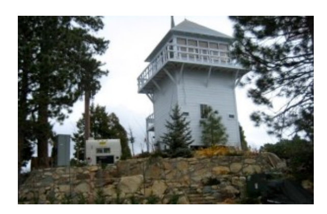
The fire look out today.

The U.S. Forest Service photo from about 1932 is of the Zephyr Point fire lookout.