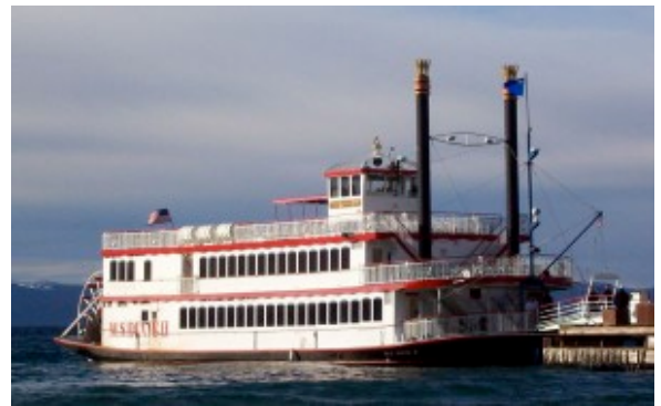
M.S. Dixie II

Twenty years later, the M.S. Dixie was replaced by a brand new M. S. Dixie II, the largest ship on Lake Tahoe. It is based at Zephyr Cove.