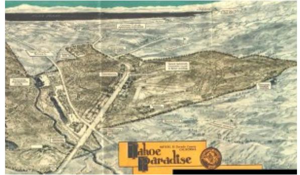
Tahoe Paradise proposed development. Photo/Theresa and Darrell Eymann

The proposed Tahoe Paradise Inn. Photo/Theresa and Darrell Eymann