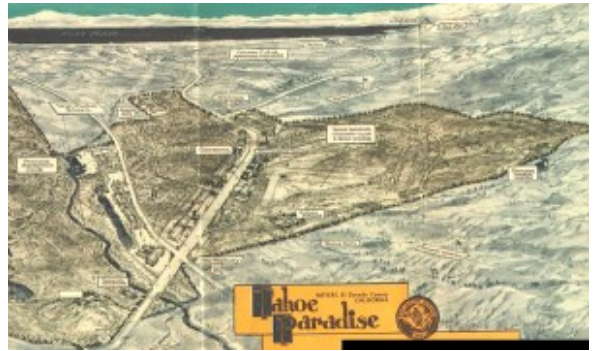
Tahoe Paradise proposed development. Photo/Theresa and Darrell Eymann

The proposed Tahoe Paradise Inn. Photo/Theresa and Darrell Eymann