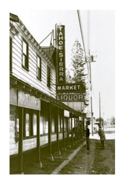
Tahoe Sierra Market

Next to the Barton Ranch home building and across the driveway is the end wing of today's South Y Center.