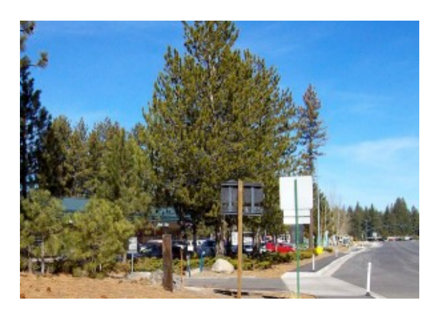
The Y today.

Today, the historic Barton Ranch front building still stands unobtrusively on highways 50 and 89 near the Y in South Lake Tahoe across from Pier 1 Imports.