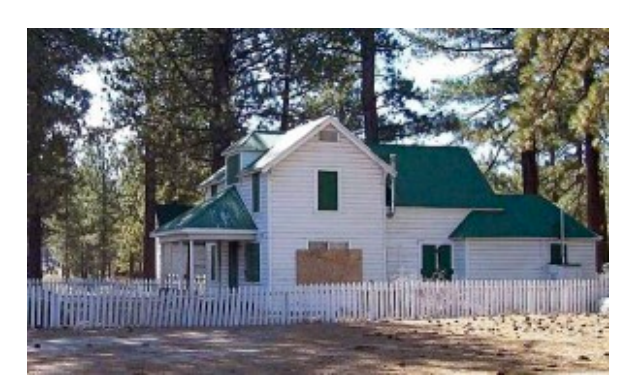
Boarded up Barton Ranch building in South Lake Tahoe.

Today, the historic Barton Ranch front building still stands unobtrusively on highways 50 and 89 near the Y in South Lake Tahoe across from Pier 1 Imports.