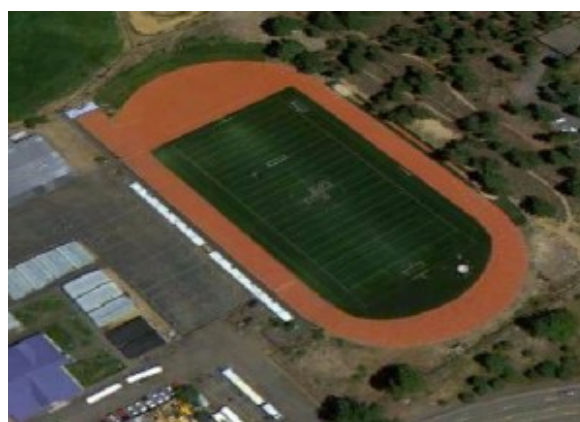
The track at STMS today.

The 1968 Summer Olympics (the XIX Olympiad) were in October in Mexico City, 7,350 feet above sea level.