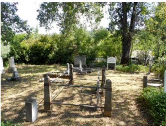
Jewish Pioneer Cemetery