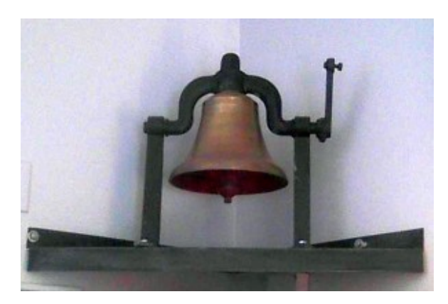
The old bell is at Tahoe Valley Elementary.

The schoolhouse building was picked up and moved to the corner of Young Street and William Avenue behind Ahern Rentals and Chapel of the Bells. It has served as the Carpenters Local 1789 Hall for decades.