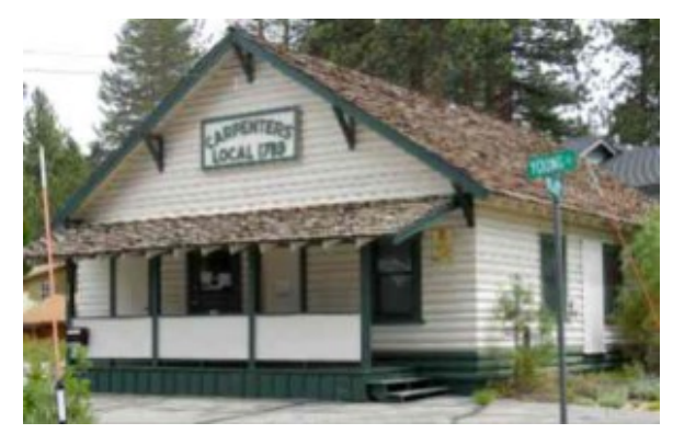
Today the building is used by the carpenters union.

The Lake Valley schoolhouse was at the Y in South Lake Tahoe until the 1950s when Safeway opened a new supermarket on that site in the building now occupied by TJ Maxx.