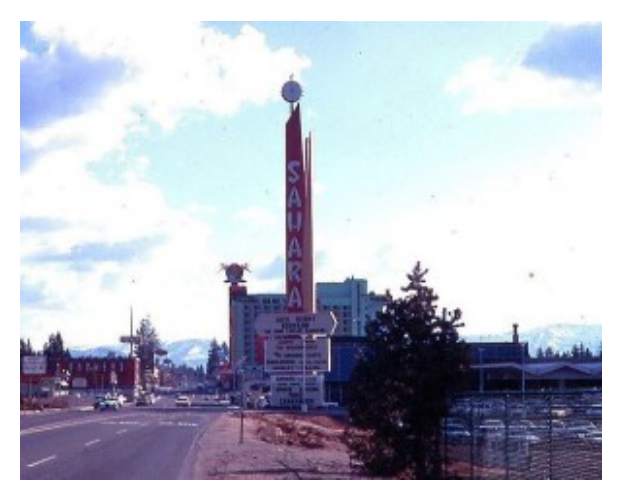
Stateline in 1972.

About 1972, the left side of Highway 50 included First National Bank of Nevada, Barney's Casino, and Harrah's. The lake side of the highway had Harvey's and the Sahara Tahoe, which opened in 1965. Entertainers listed on the Sahara sign include Jack Benny, singer Rouvaun, The June Taylor Dancers, The Modernaires, The Original Caste, Buckley & Collins, and musician Page Cavanaugh. Behind the camera and near Kingsbury, the new Harvey's Inn was under construction. In 1973, it burned to the ground the day before its opening. It is now the Lakeside Inn and Casino.