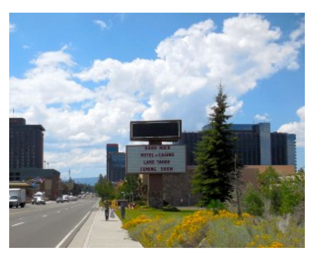
Stateline looking west in 2014.