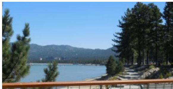
Today's Lakeview Commons.

Remindful of the famous Hollywood sign on the hillside overlooking Los Angeles since the 1920s, the Al Tahoe stood near the site of today's Lakeview Commons.