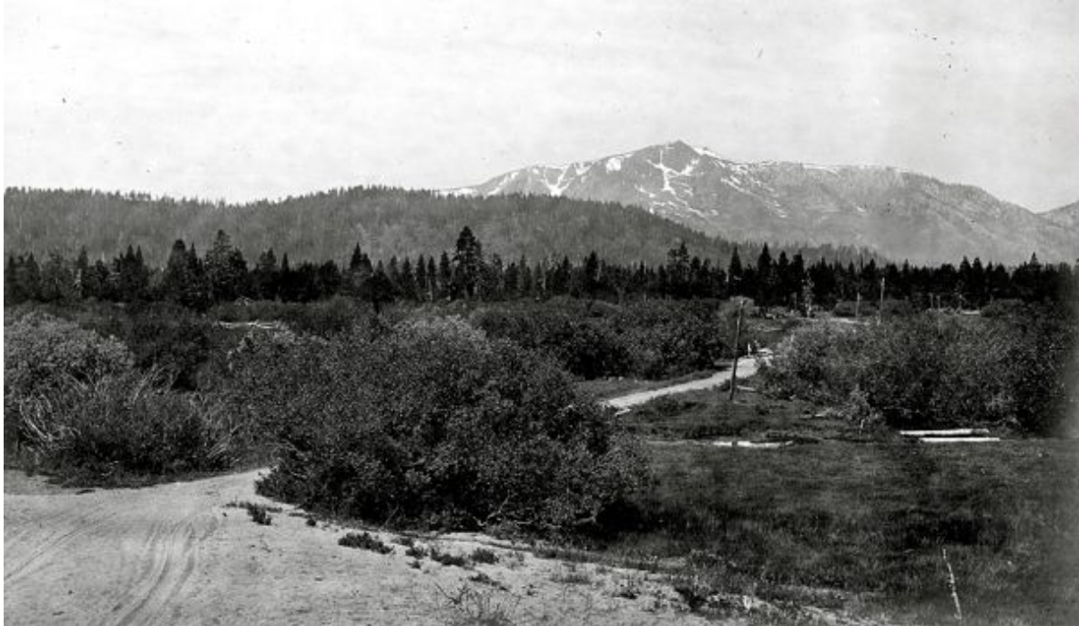
A road used to run through this South Shore meadow.

Before there was an officially-routed and designated Highway 50 at South Shore, there were various unpaved other roads. One such road ran along the shoreline from Stateline toward Tahoe Valley in the early 1900s, part of which became today's Lakeview Avenue.