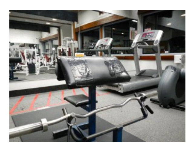
Duct tape is common on weight room equipment.

Caterers in town who need a facility that meets the health department's requirements often rent the kitchen.