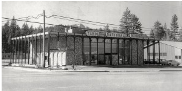
Tahoe National Bank Photo/Private Collection

Tahoe National Bank existed from 1963 to 1979 before being absorbed by Central Bank. One branch was built next to the Tahoe Valley Post Office with a drive-up teller window.