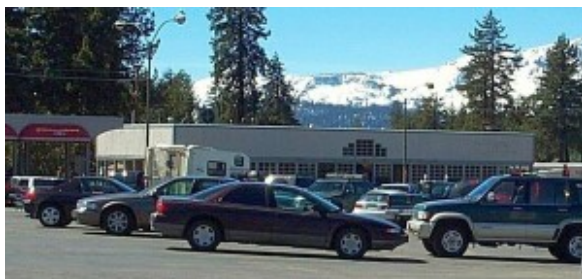
The Stateline area Tahoe

That building later has housed a clothing outlet store, video rentals, and currently Pet Supermarket.