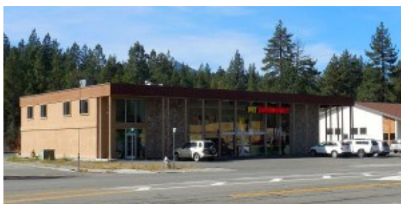
What the building looks like today.

Tahoe National Bank existed from 1963 to 1979 before being absorbed by Central Bank. One branch was built next to the Tahoe Valley Post Office with a drive-up teller window.