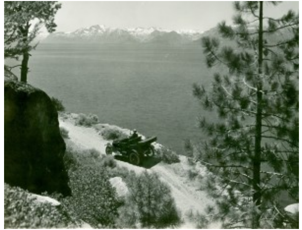
People used to drive around Cave Rock.

A second tunnel was completed in 1957 to accommodate the new four-lane Highway 50 between Carson City and Stateline, with the original tunnel serving the westbound traffic lanes.