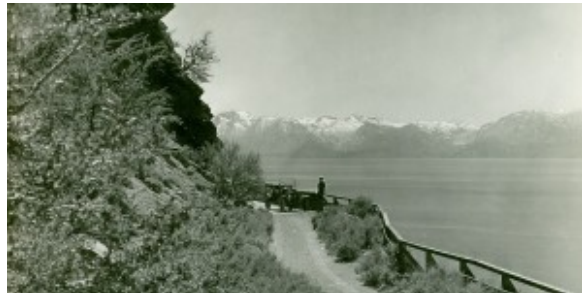
A vehicle on the trestle.

Rocks and timbers comprised a trestle built in the 1860s.