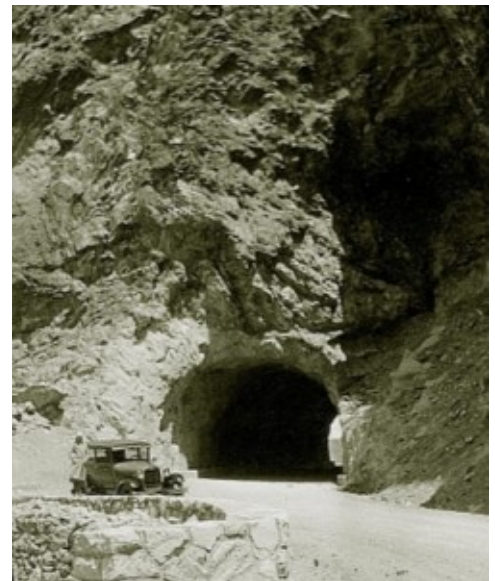
The tunnel in 1932.

A second tunnel was completed in 1957 to accommodate the new four-lane Highway 50 between Carson City and Stateline, with the original tunnel serving the westbound traffic lanes.