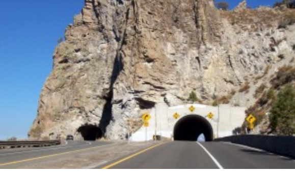
Present day Cave Rock.