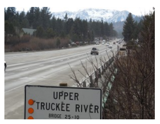
Foliage is more over grown today along the highway.