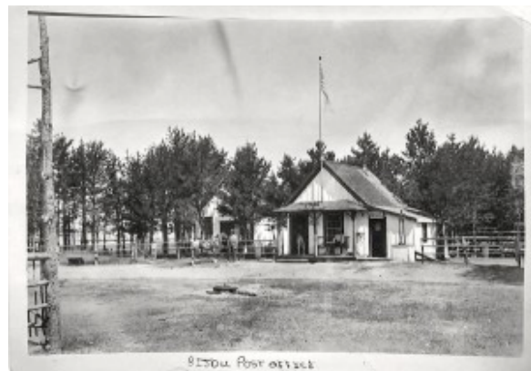
Bijou Post Office