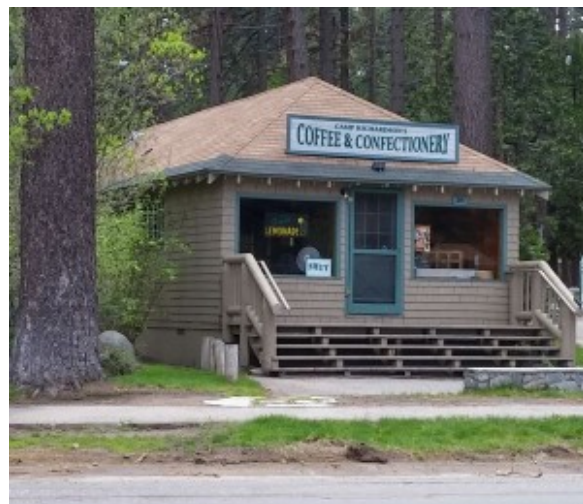
This was once a post office in Camp Richardson.

There was a Tahoe Keys Post Office which operated briefly from 1959 until 1962 as a branch of the Tahoe Valley Post Office.