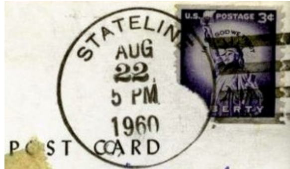
Two local postmarks before South Lake Tahoe was formed.

There was a Tahoe Keys Post Office which operated briefly from 1959 until 1962 as a branch of the Tahoe Valley Post Office.