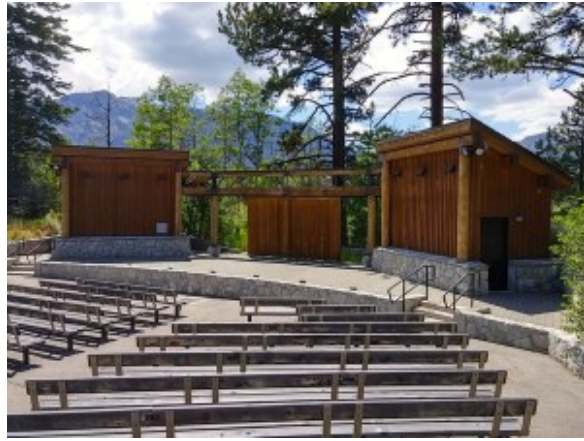
Lake of the Sky Amphitheater on the South Shore.

The amphitheater, which is owned and operated by the U.S. Forest Service, was remodeled about 10 years later. The single 1997 stage was in the area between the twin structures. Lake Tahoe Community College has had commencement ceremonies at this site.