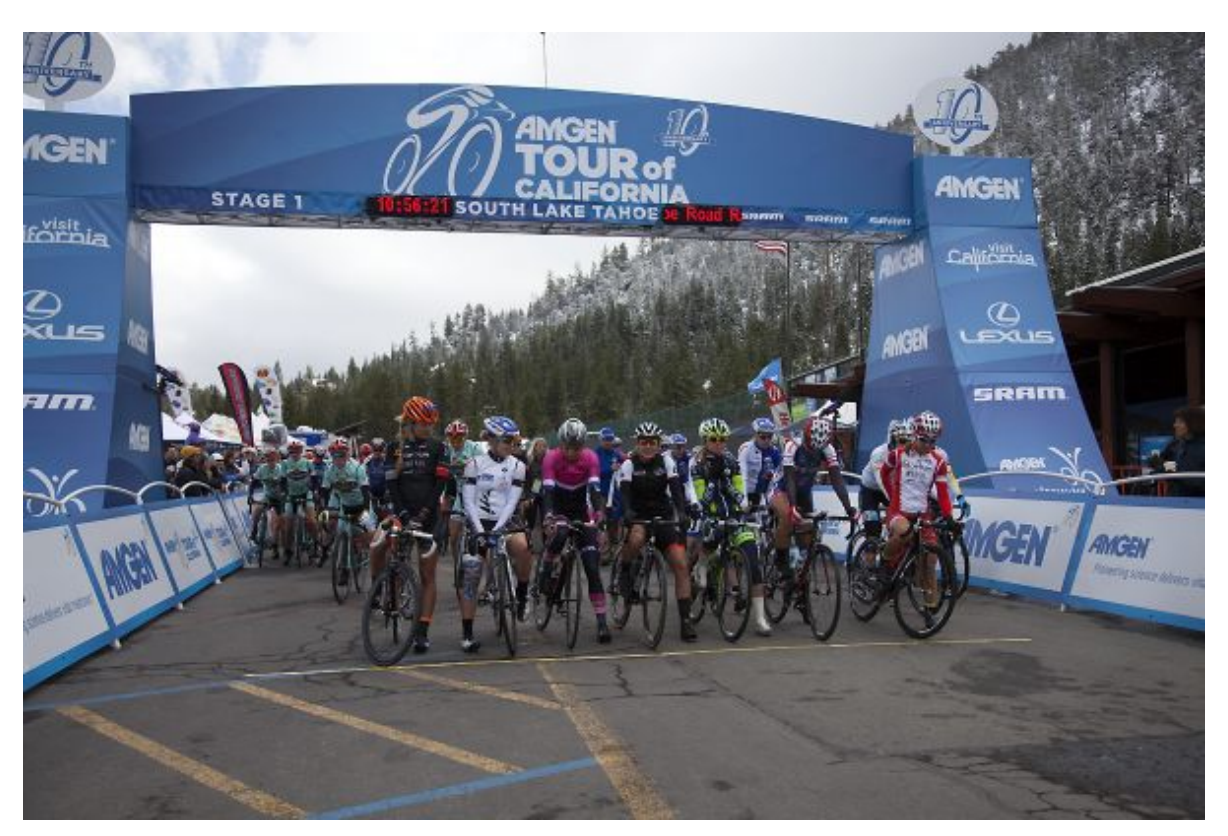
As in 2015, the women in 2016 will start from Heavenly Mountain Resort's Cal Lodge.

New this year is the men and women will be riding from the same start locations, but not on identical courses so they are not actually competing against each other.