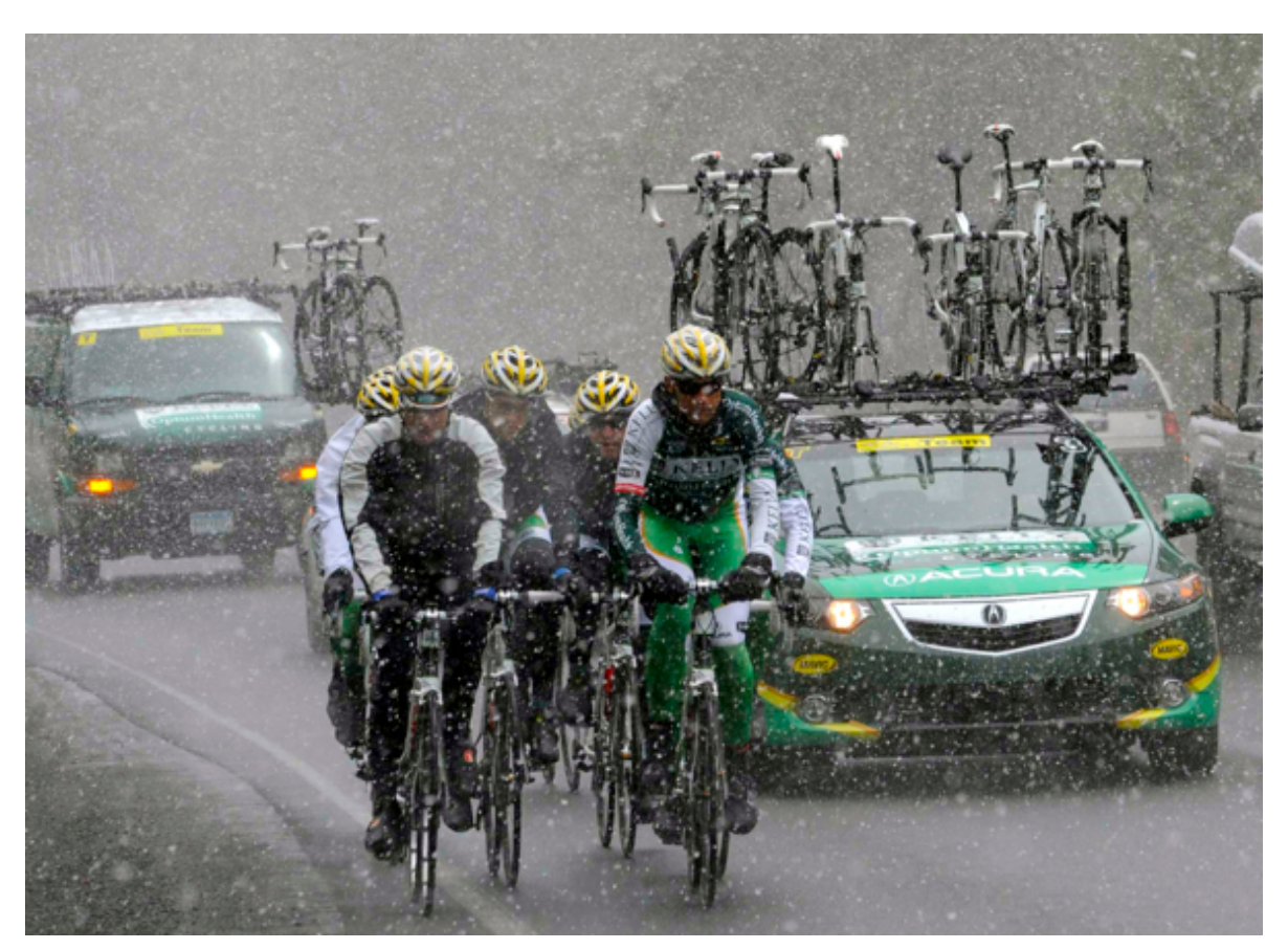
Tour of California organizers are confident snow will not be an issue in Tahoe like it was in 2011.