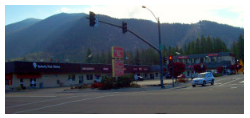
This is the Ski Run Center as it stood in October 2007, shortly before being razed.

As I recall, in the 1960s there was a section between the KFC and the adjacent Video Maniacs 2 which was an open-air covered patio for Burger Bar diners.