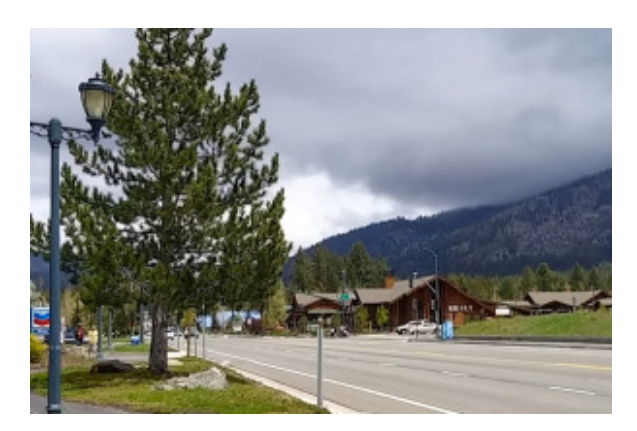
The Ski Run Center as it looks today.

As I recall, in the 1960s there was a section between the KFC and the adjacent Video Maniacs 2 which was an open-air covered patio for Burger Bar diners.