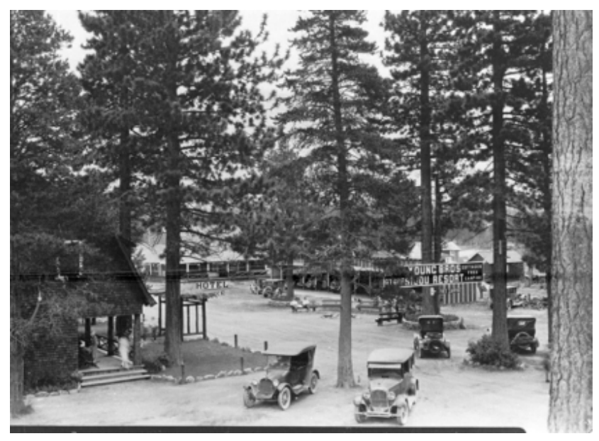
Young' Bijou in the 1920s.

Occasionally I find additional interesting photos about sites previously visited on Then and Now. Here is more pictorial history of the Bijou Center and Conolley's in South Lake Tahoe: