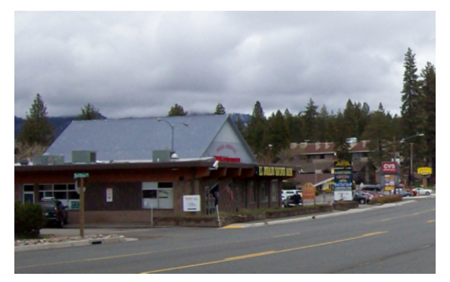
The Bijou Center as it looks in 2015.

is the Beach Retreat and Lodge (formerly Timber Cove).