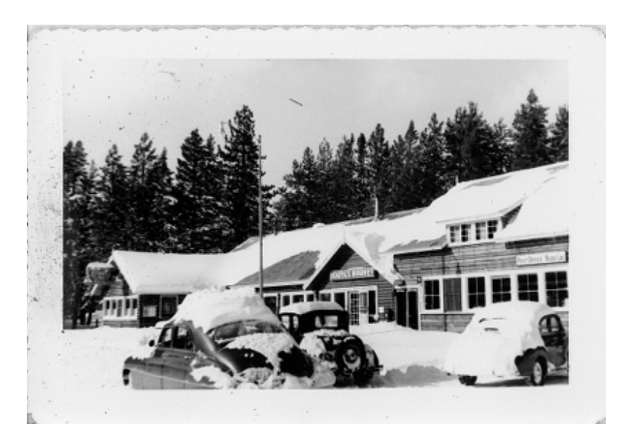
Four-wheel drive was not an option in the 1950s.

By 1951, Young's included a market, fountain, and the Bijou Post Office. Adjacent was the historic Bal Bijou dance hall built in the 1930s.