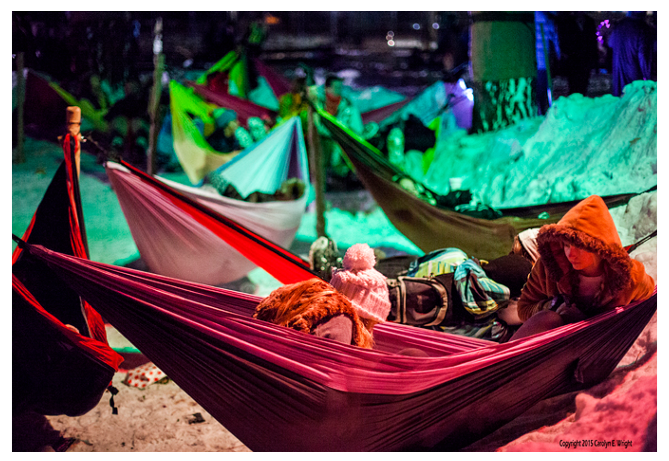
Cozy hammocks are one way to beat the chill.

having to wait. What frustrated her was at the entrance she and the other VIP'ers were supposed to have their own line to speed up the process. Instead they were with the throngs of concertgoers.