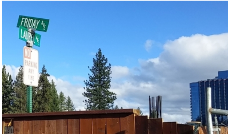
The last Laurel Avenue street sign.

The final vestige of Laurel Avenue – its street sign – was removed in November 2015.