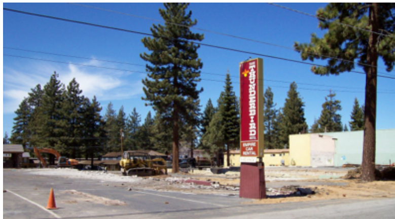
The remains of the Thunderbird at 4123 Laurel Ave. on April 19, 2007.

In 2007, the Chateau project called for the removed of all buildings on Laurel Avenue and the avenue itself. At that time the development was to be two hotels, a convention center, retail and open space. At more than $400 million it was to be