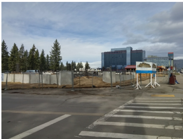
Renamed Zalanta, one of the hotels is under construction.