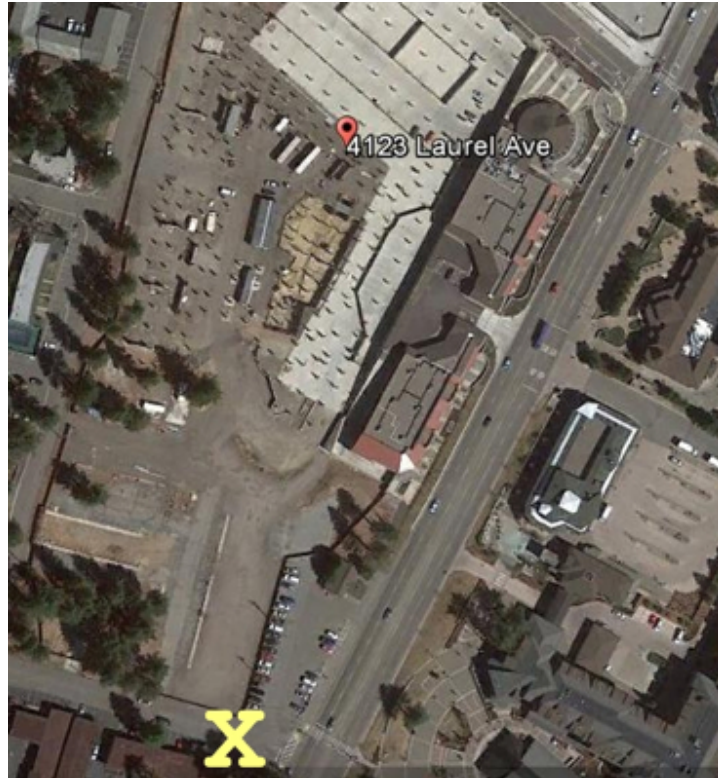
The X marks where Laurel Avenue was. Photo/Google/April 2015

the most expensive development project in the history of South Lake Tahoe. That was pre-bankruptcy.