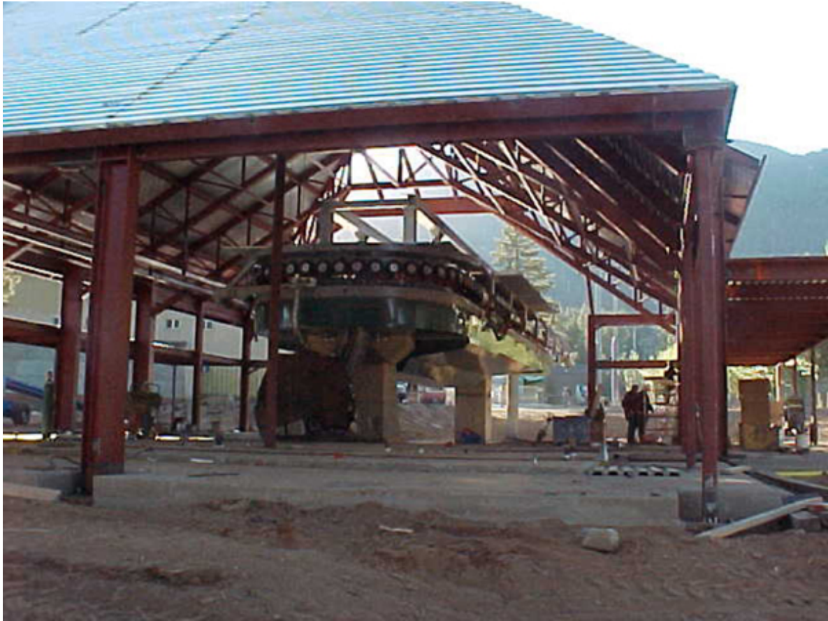
The gondola under construction.