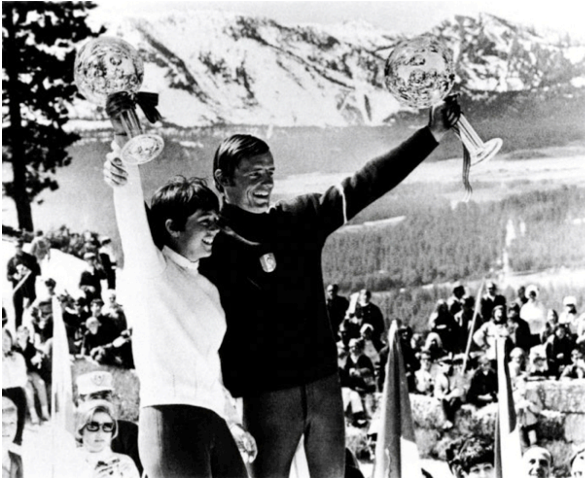
Nancy Greene and Jean Claude Killy when World Cup races were held at Heavenly.