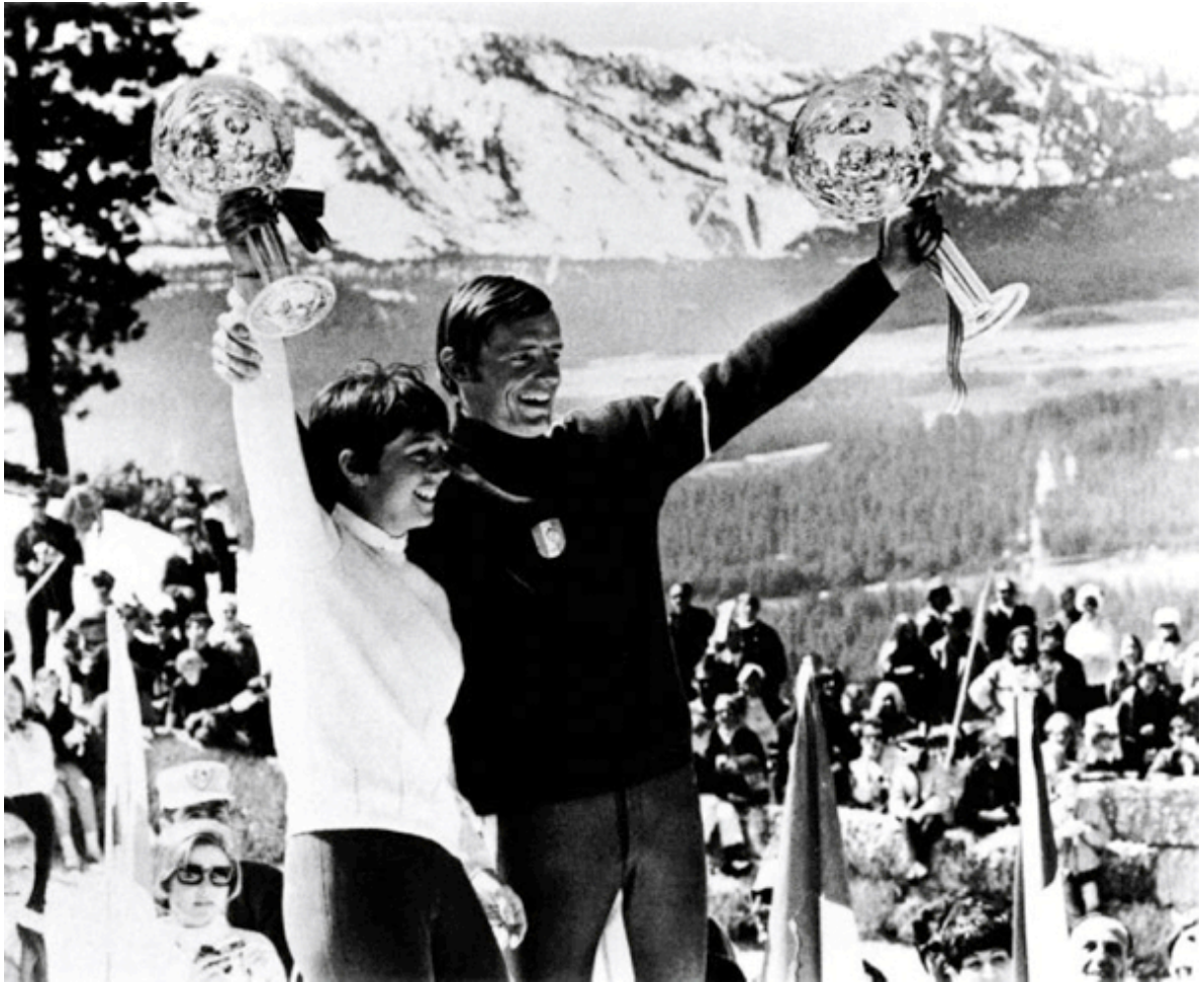
Nancy Greene and Jean Claude Killy when World Cup races were held at Heavenly.