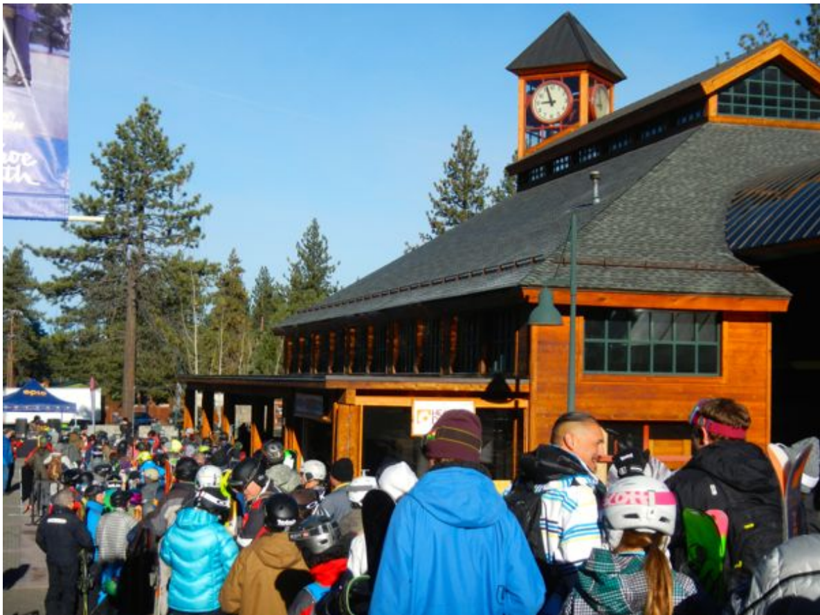
The Heavenly Village with the gondola links the town to the mountain.

Most stakeholders and observers see the change in atmosphere as “different.” Many of the ski resorts from the 1950s to 1980s were run by families. Now the ski industry has gone corporate, with stockholders to satisfy, as well as cash to improve tired infrastructure.