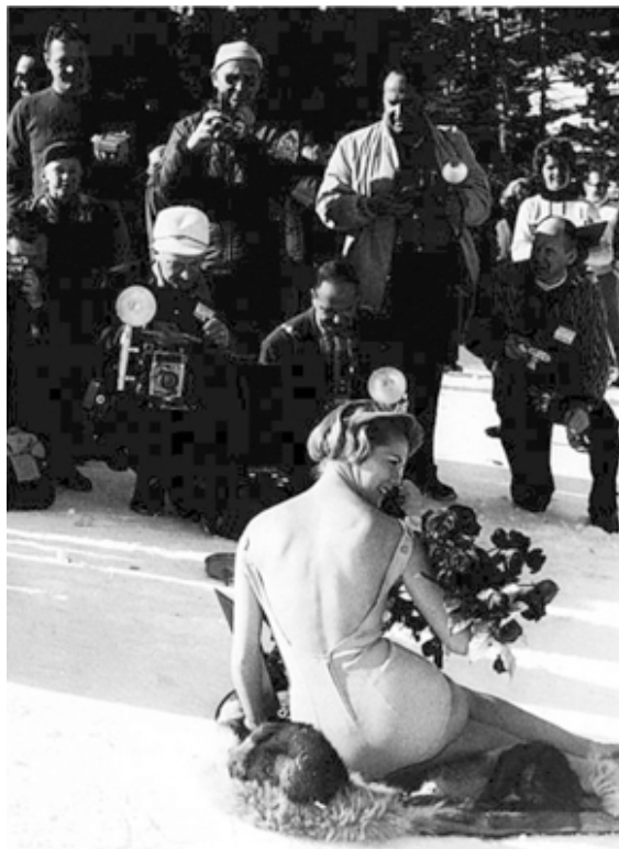
Miss Snow used to be an annual event at the resort.