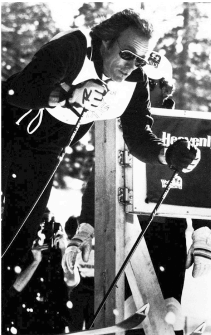
Clint Eastwood competes in the John