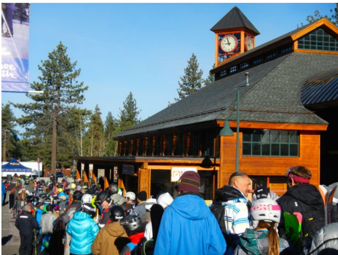
The Heavenly Village with the gondola links the town to the mountain.

Most stakeholders and observers see the change in atmosphere as “different.” Many of the ski resorts from the 1950s to 1980s were run by families. Now the ski industry has gone corporate, with stockholders to satisfy, as well as cash to improve tired infrastructure.