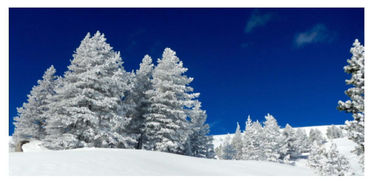
Frosty trees dot the landscape.