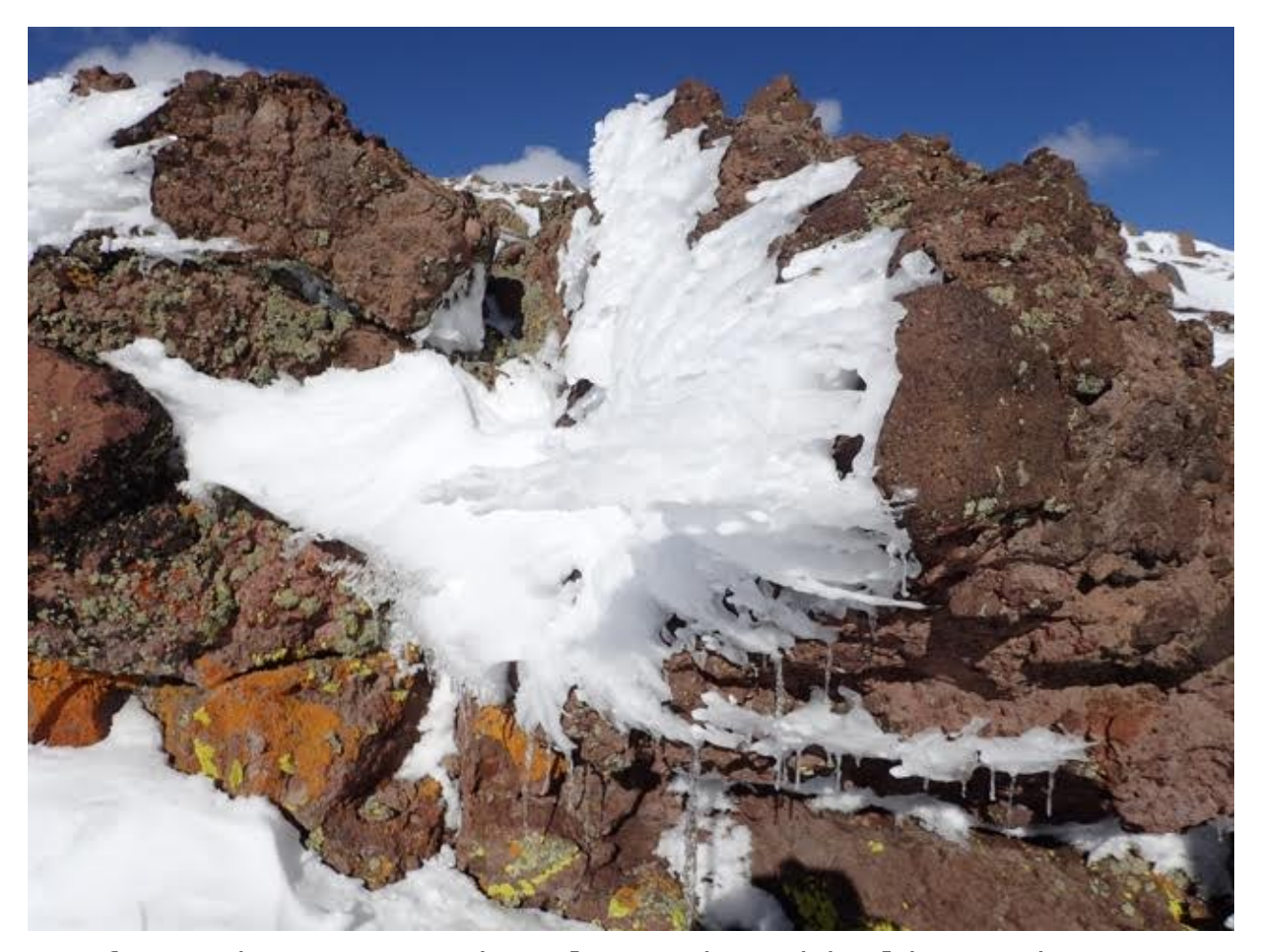
Ice formations on rocks along the ridgeline.

That wind whipped ice formations onto rocks in what looked like works of art, especially with the orange lichen nearby.