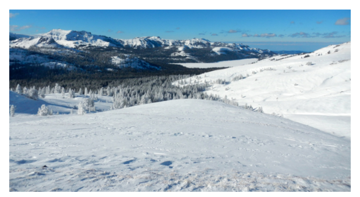
Caples Lake in the distance is popular with ice fishermen this time of year.