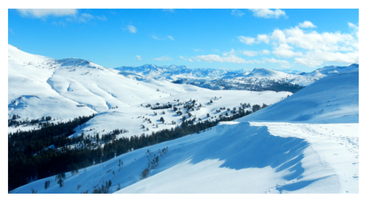
Snowy mountains for as far as the eye can see.