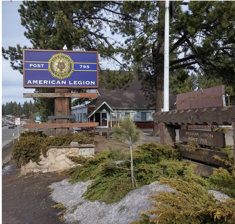
What the American Legion looks like in 2016.