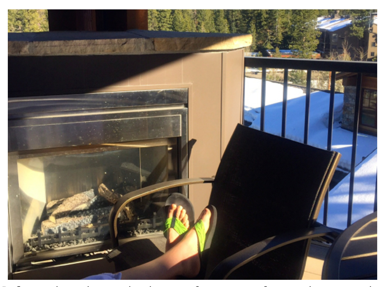
Relaxation is a dominant feature of staying at the Northstar Lodge.