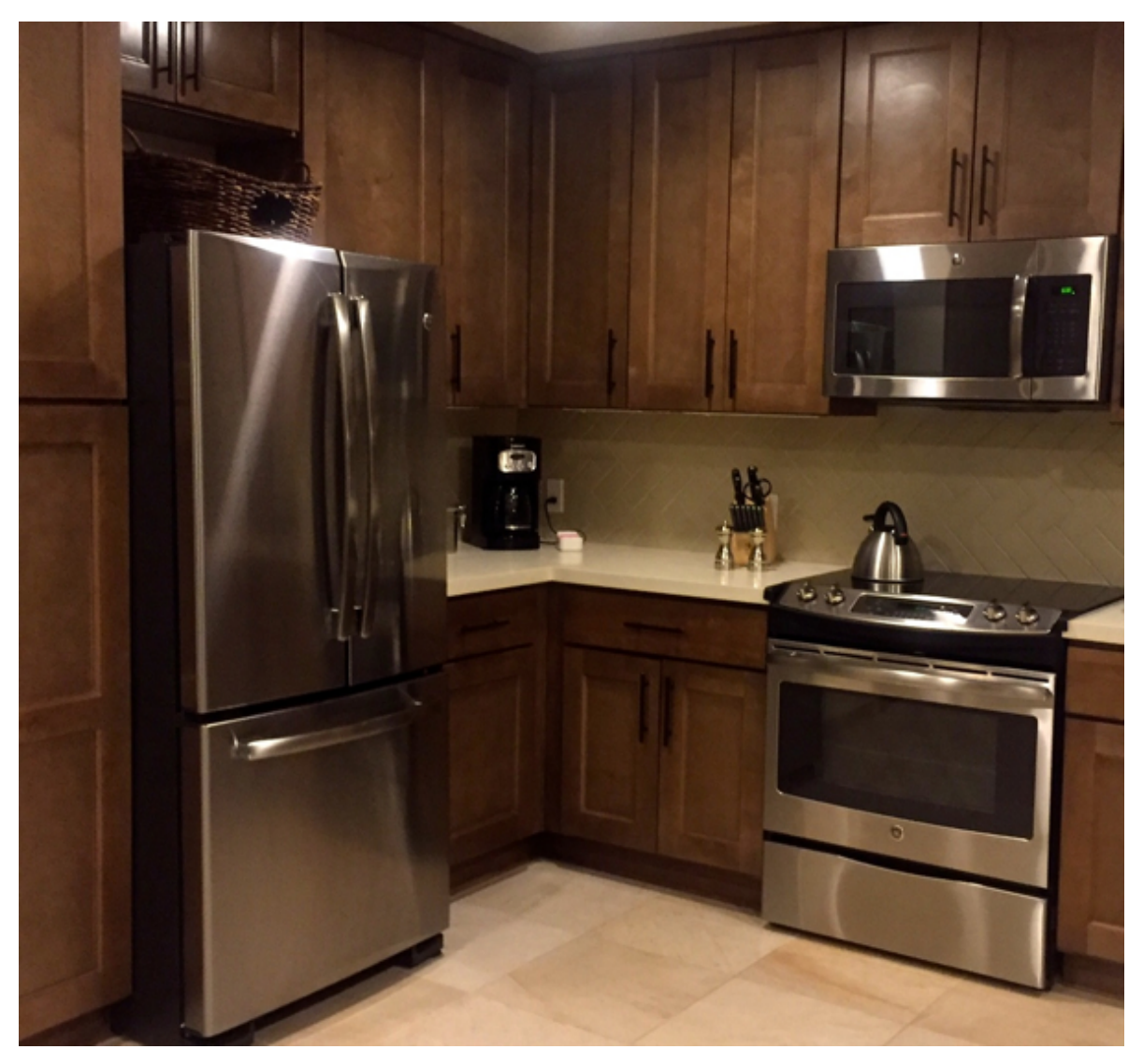
A full-size kitchen makes long stays comfortable with not having to eat out every night.

"We like the amenities," Derian Boebel said.