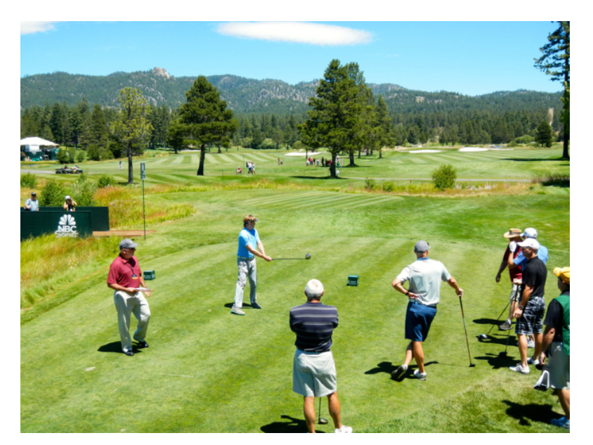
Actor-singer Jack Wagner is ready to tee off.

On July 21, Curry was patient as the crowds swarmed and flung all sorts of paraphernalia at him to sign. Selfies were part of the requests, too. So was signing and throwing footballs on hole 17.