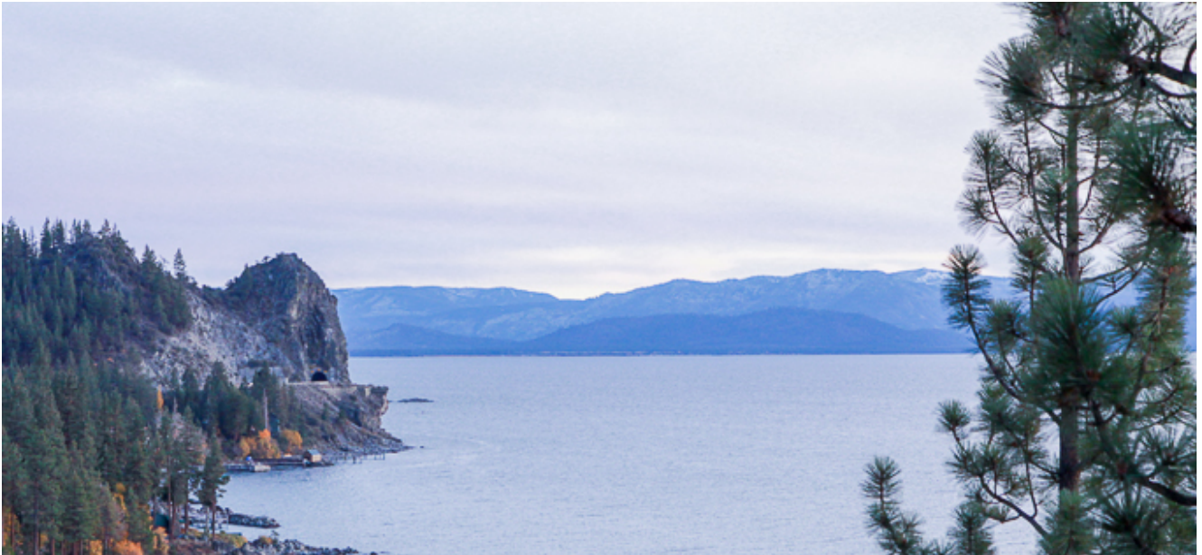
Cave Rock from the Logan Shoals vista.

Quick, easy to get to, less than one mile round trip, with the majority of the trail being an old utility easement road with a gentle gradient. Only the last couple of hundred feet does it do a small climb, scrambling up a rock stairway to the summit.