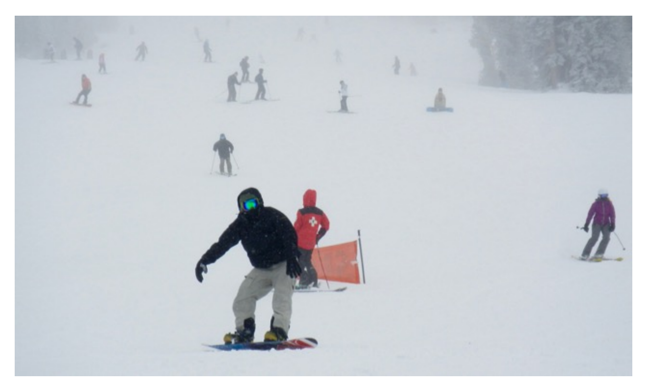
Snowboarders and skiers enjoy good coverage on limited terrain at Heavenly on Nov. 23.