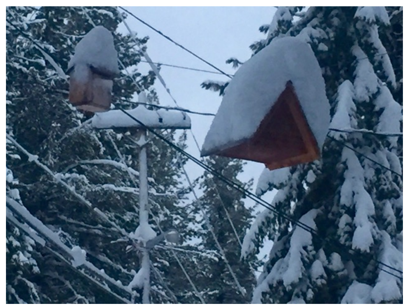
Power lines are drooping on Taylor Street in South Lake Tahoe on Jan. 13 and at many locations in the basin.