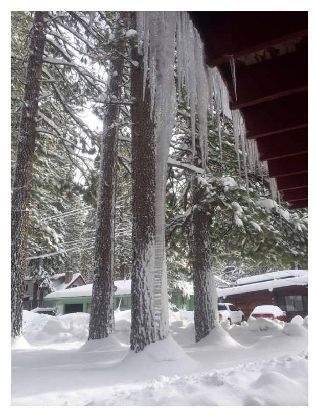
Ice is on roofs and the roads in Tahoe.