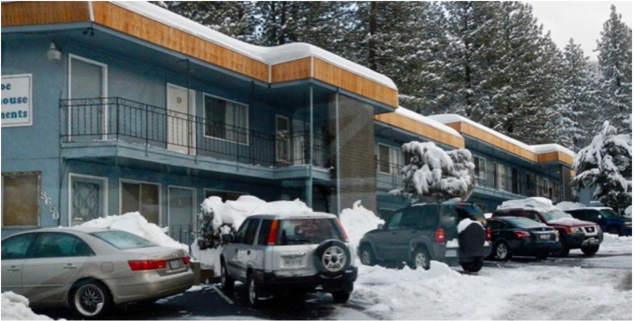
Affordable housing stock in South Lake Tahoe is lacking.