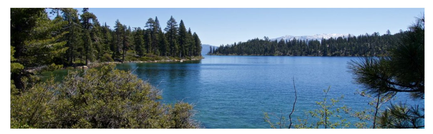
Emerald Bay shimmers on a warm spring day.

trail changes, the perspective alters from it seeming to be within reach to being a scary dive.