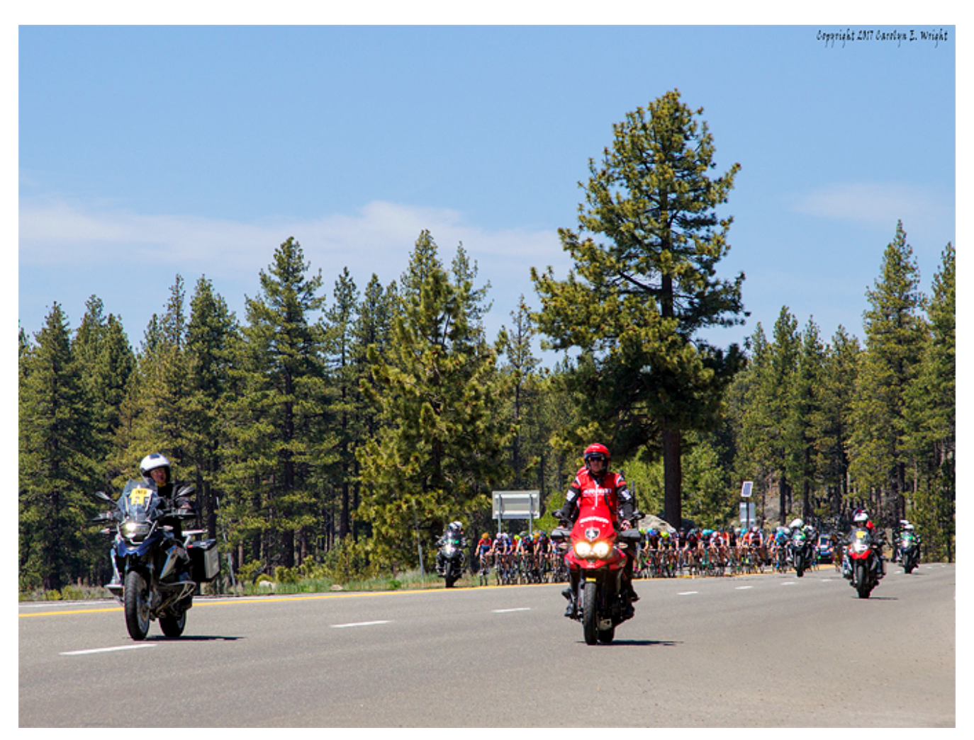
The women on Thursday take over Highway 50 on the South Shore.