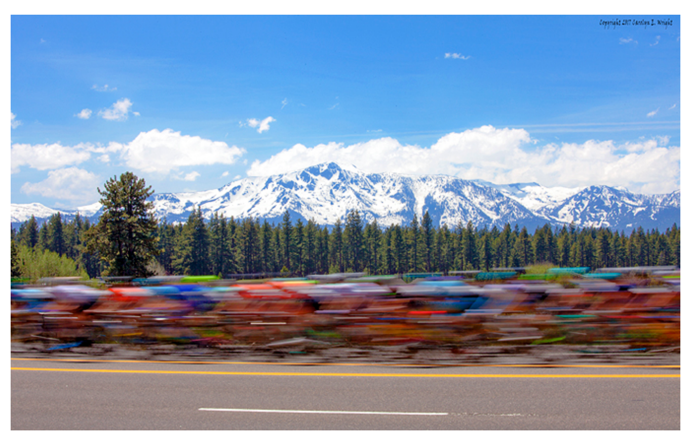
The peloton whizzes through Stateline on May 11.