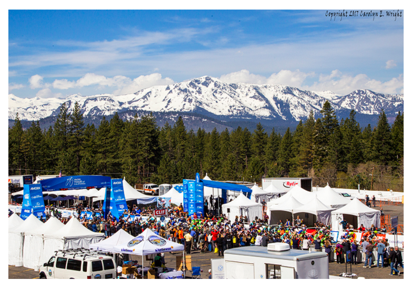
Mount Tallac looms large as the women start stage one from Heavenly on May 11.

"It was more pleasant being a part of the Donner Party than what is going on here," the announcer said as the women were making their final push to the end.