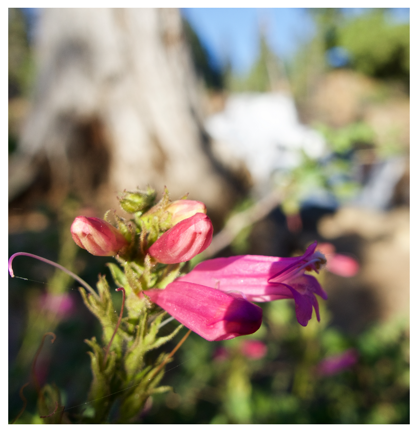
Wildflowers near Glen Alpine Falls are starting to bloom.

Still, the destination was worth testing the suspension and being worried about the alignment.