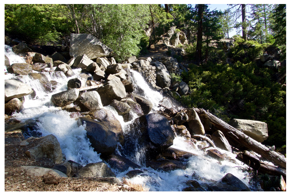
Hawley Grade Falls are not passable right now.

When there is less water it's possible to cross the falls. It doesn't even look inviting right now or like it would be a possibility anytime soon.