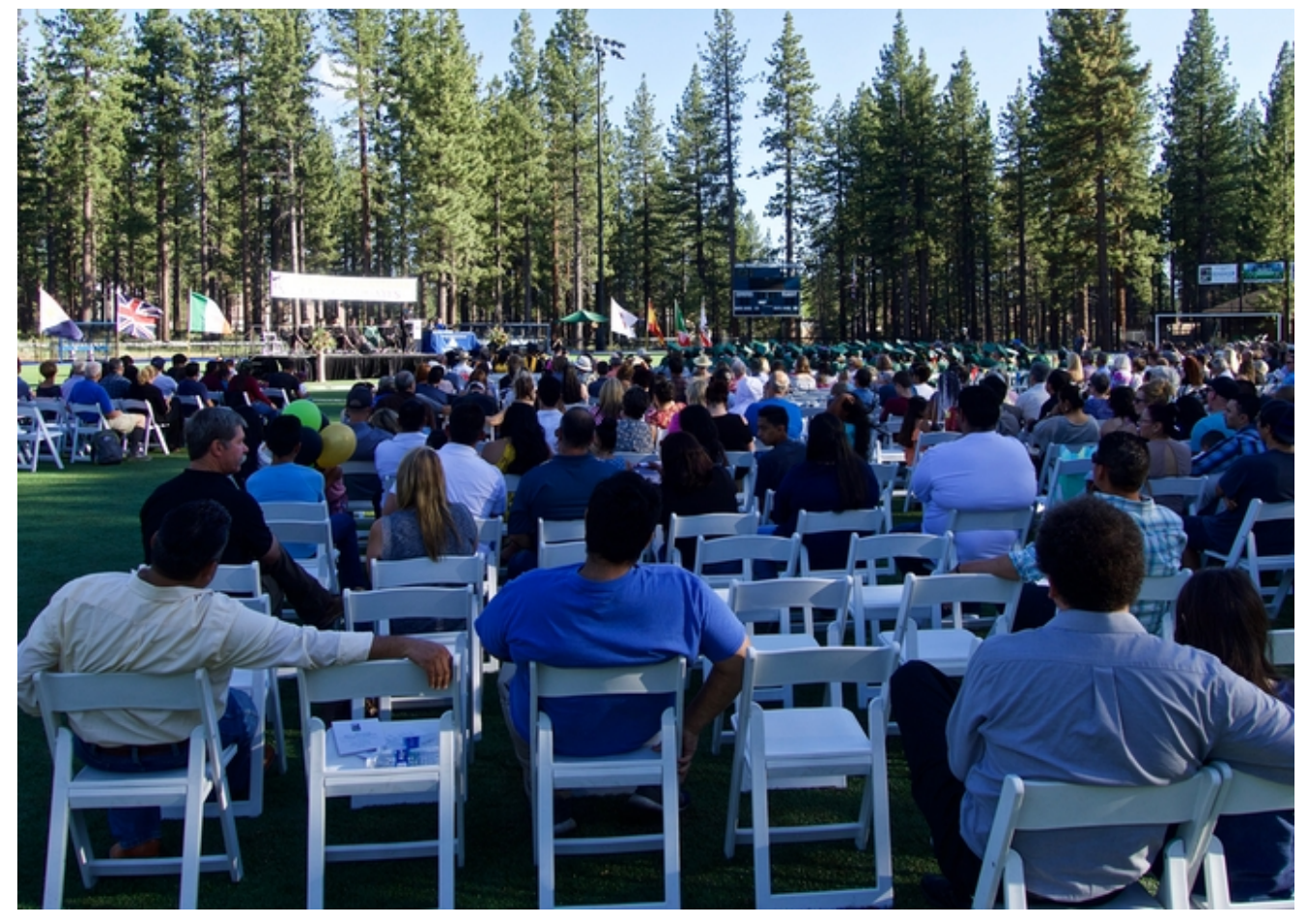
A few hundred people listen to the graduation speakers June 30.

Ten of those receiving associate of arts degrees had a 4.0 gpa. Twenty-six had grade point averages between 3.65 and 3.99. Seventy-eight of these AA degree earners also received a transfer degree, which guarantees them entry as a junior at a California State University this fall.