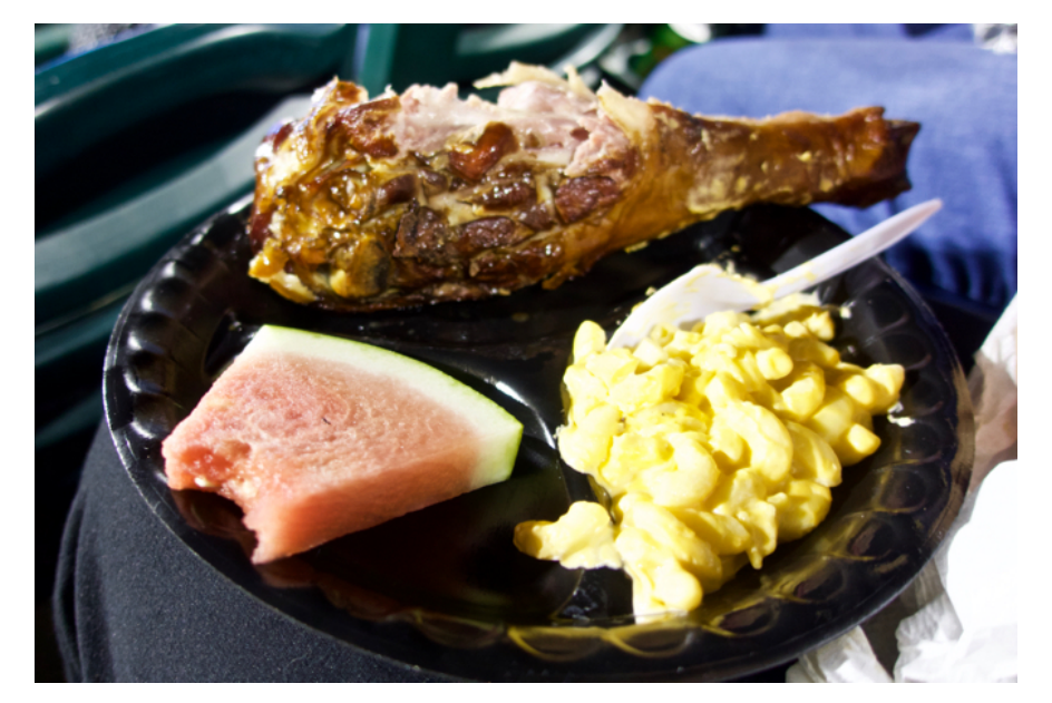
Food goes well beyond the ordinary hot dog.

The quality of ball is sporadic, but then the same could be said of the Giants at this stage of the season.