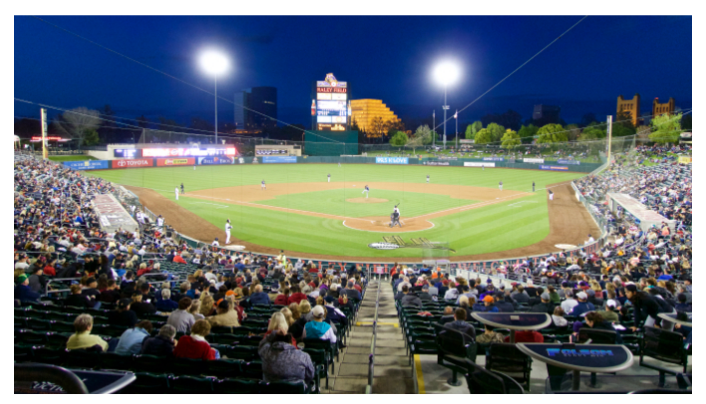
The River Cats know how to entertain a crowd with baseball and gimmicks in between innings.