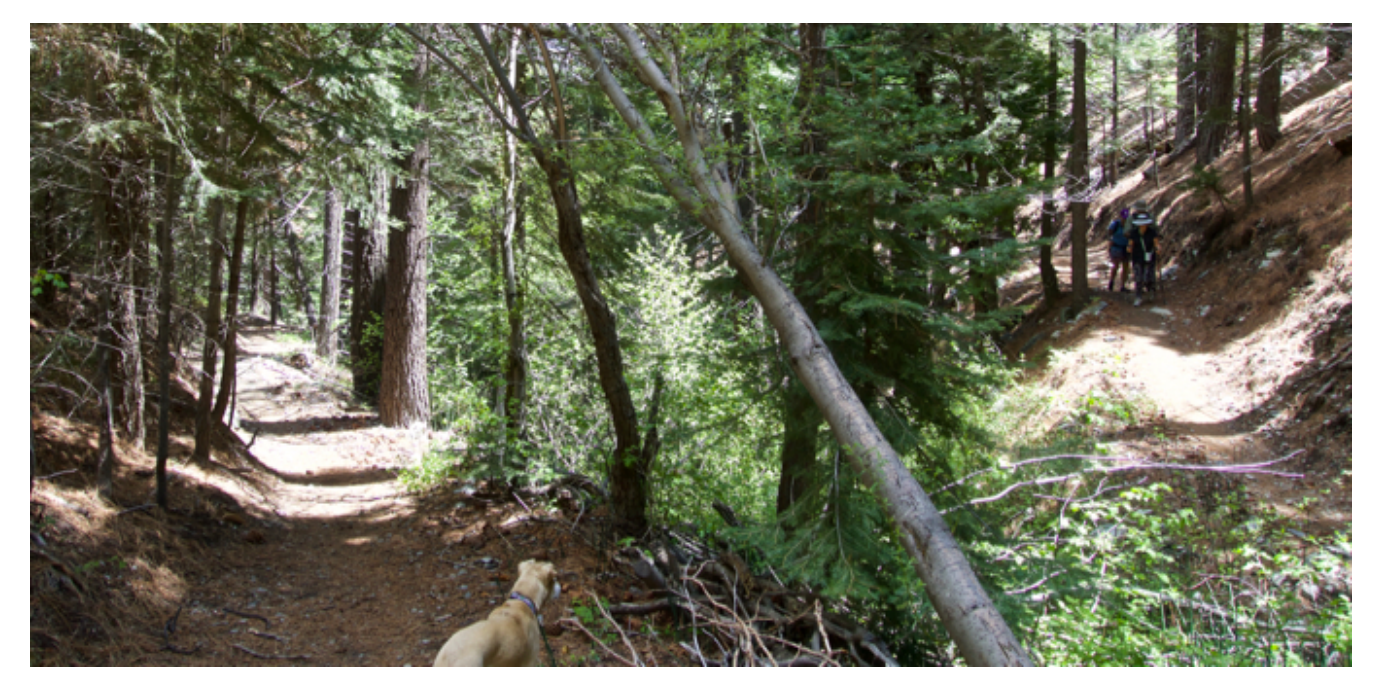
Switchbacks are necessary to ease the steepness.

It's understandable why signs recommend cyclists and equestrians stay off this trail — it's the verticle. Still, that didn't deter a couple mountain bikers who passed us. Fortunately, we all shared the trail respectfully.