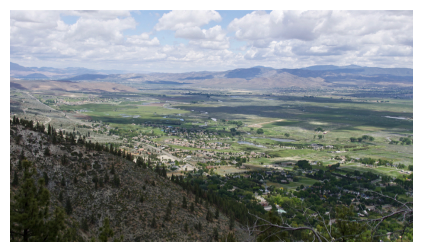
Plenty of lush green grass for the cattle in Carson Valley.