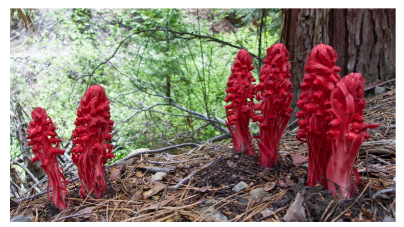
Vibrant snowplants just off the trail.

iffy because you don't have to go up far in elevation to still hit snow. That is why starting lower is a safe bet.