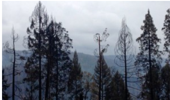
The King Fire scorched trees on both sides of Highway 50 near Fresh Pond.

Crews overnight were able to hold the King Fire to 97,099 acres and 89 percent containment. The active fire continues to burn within the containment area.