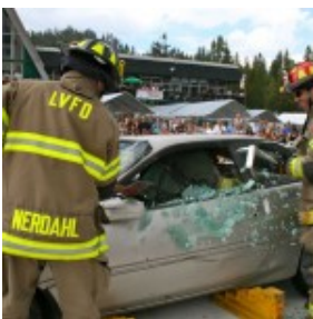
Lake Valley firefighters practice

They beat out last year's champs – CalFire.