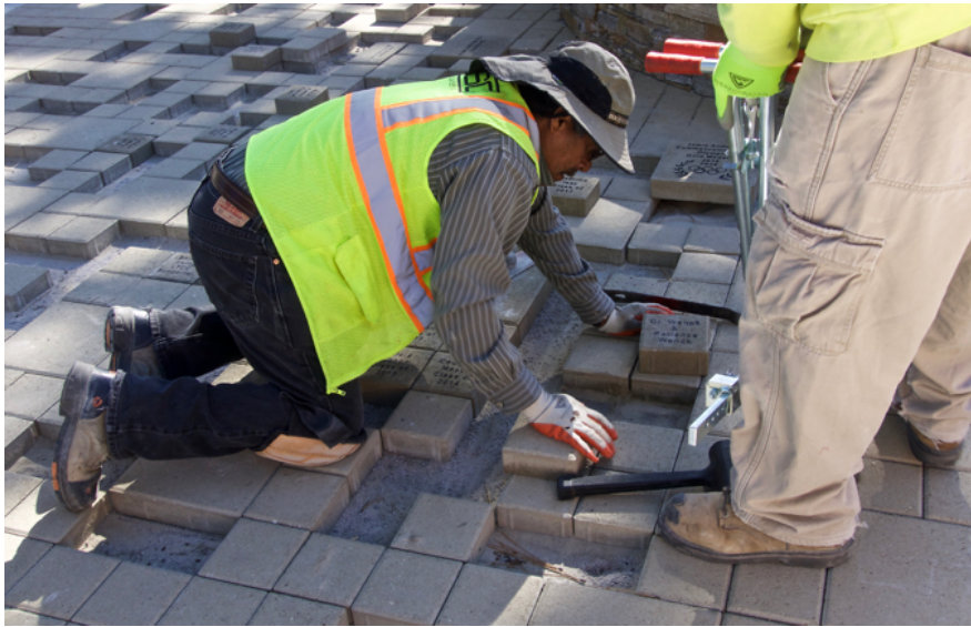
Workers on June 18 place pavers at Coyote Legacy Plaza.

With a special tool and eye toward precision, workers on June 18 were carefully placing the pavers for Coyote Legacy Plaza.